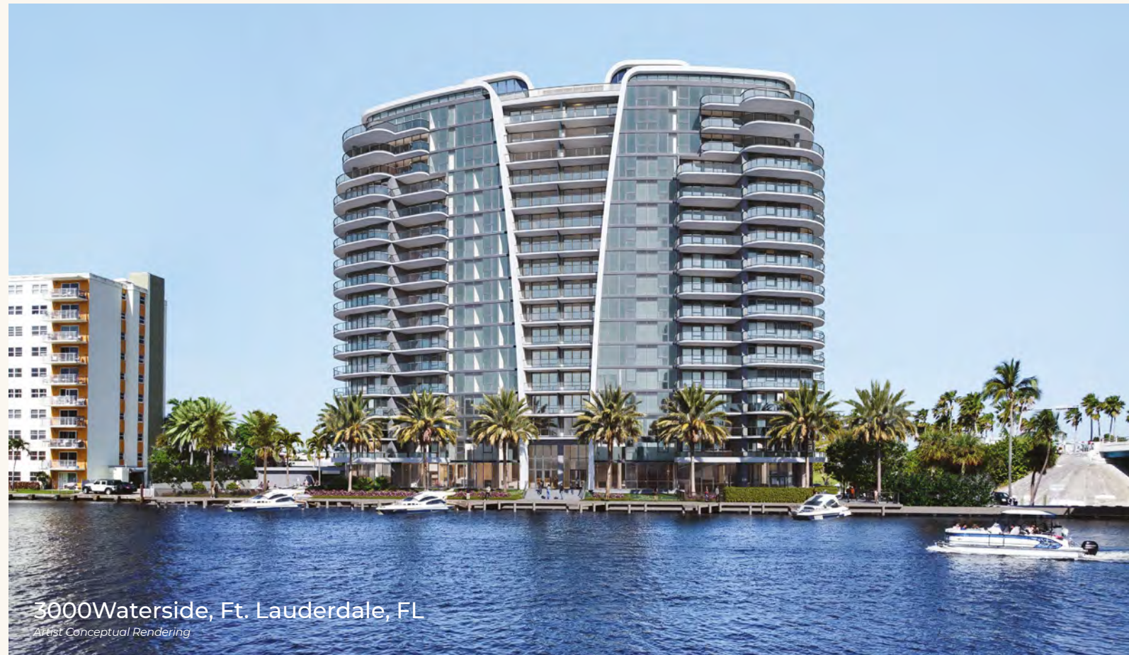
3000Waterside, Ft. Lauderdale, FL Artist Conceptual Rendering