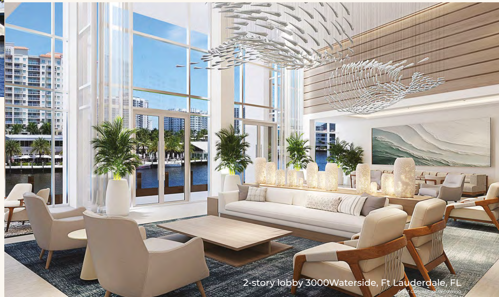
2-story lobby 3000Waterside, Ft. Lauderdale, FL Artist Conceptual Rendering