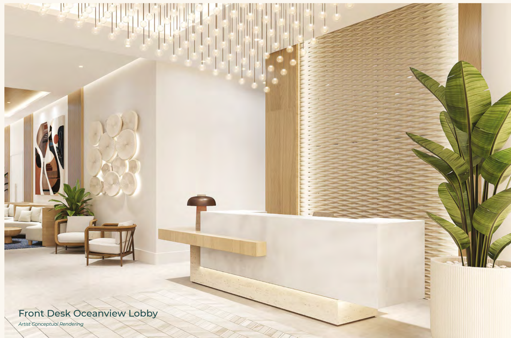
Front Desk Oceanview Lobby Artist Conceptual Rendering