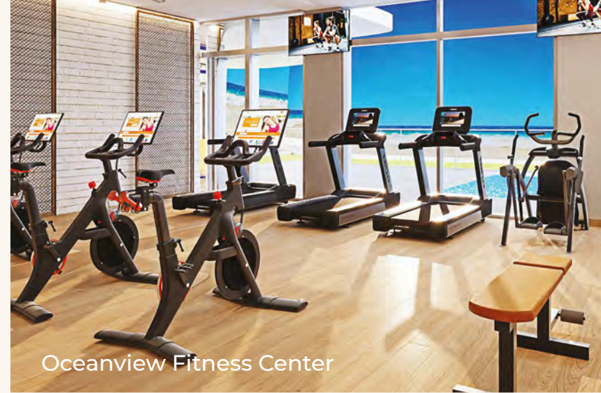
Oceanview Fitness Center