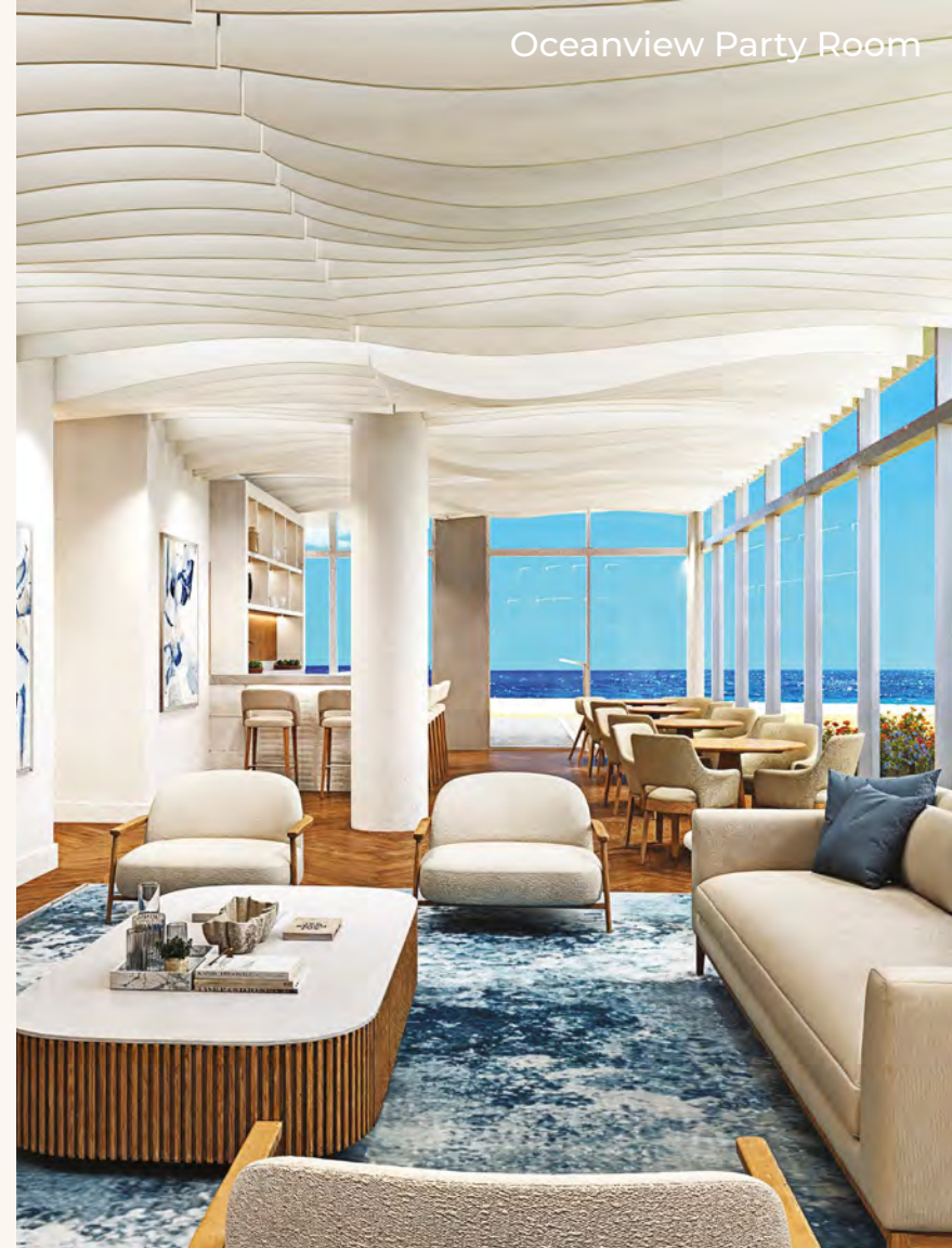
Oceanview Party Room

The state-of-the-art fitness center overlooks the ocean making it ideal for those who embrace an active lifestyle.